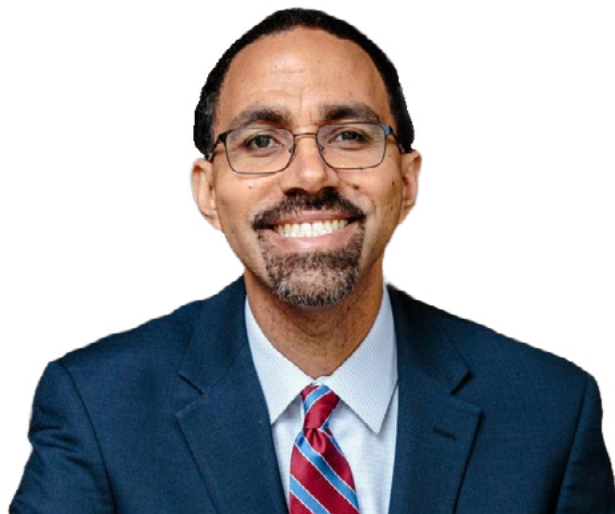
Sec. John B. King Jr. Chancellor, State University of New York (SUNY)