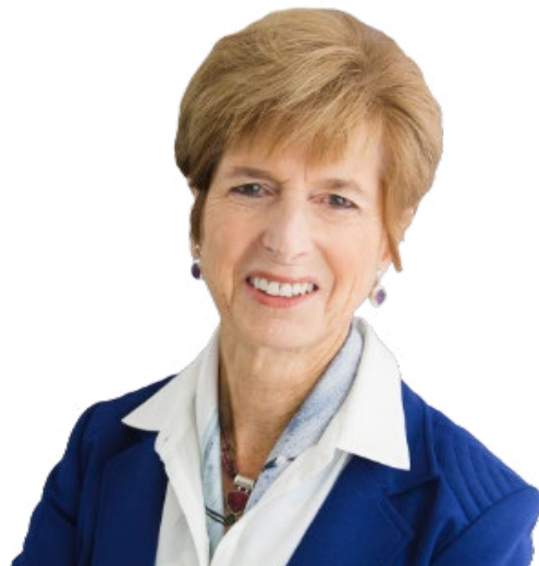
Gov. Christine Todd Whitman President, Whitman Strategy Group