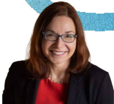
Katharine Hayhoe Chief Scientist at The Nature Conservancy